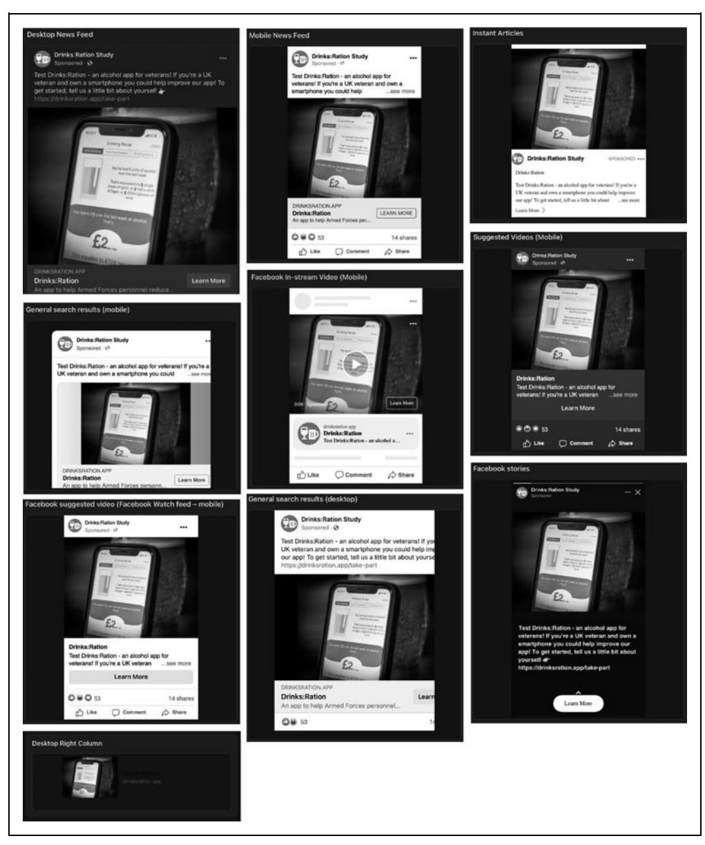
Appendix Fig A1. Examples of Facebook Ads.