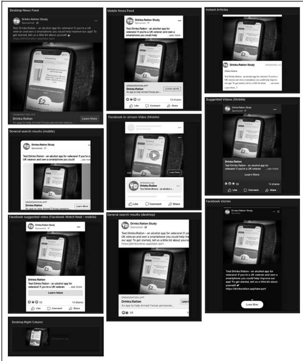
Appendix Fig A1. Examples of Facebook Ads.